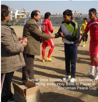
Nepal Bible Society, General Secretary giving away Holy Bible to Player in Christmas Peace Cup

First Christmas Peace Cup 2010 For the first time Kathmanduise heard the Christmas Peace Cup Football. We organize this national standard tournament to publish the gospel message. For this we used the name Christmas for which media was very glad to put in Paper. Hosanna Group became the main sponsor for the tournament which contributed nearly 1500 dollar. Local organizations and companies also became the partners. Total expense of the event was around 8000 dollar. Thanks to all groups for making their valuable contribution. We request and encourage them to sponsor future events too. I see that non-