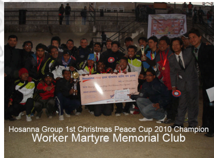
Hosanna Group 1st Christmas Peace Cup 2010 Champion Worker Martyre Memorial Club

Ex-student Retreat Program was held in Kathmandu after the Christmas. Some students missed this retreat because they still had Christmas program in their Church. Pastors, Evangelists and Leaders, eighteen of them, submitted their profile. Profile has every thing